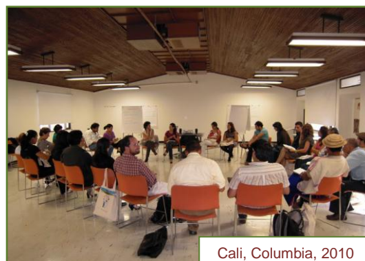
Cali, Columbia, 2010