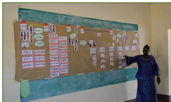
Using a timeline, Founzan, Burkina Faso, 2012