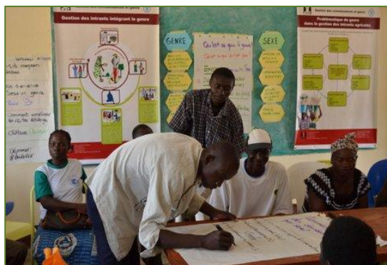
Founzan, Burkina Faso, 2012

As the share fair is not an end in itself, it is important to clarify the objectives from the beginning, in order to obtain the expected impact. To assess impact, it is helpful to look at summaries of the sessions, the notes, cards and articles written specially for the fair, as well as other reports collected by the organizers to document the various themes. All of this material needs to be assembled, handled and made available, where possible. Documenting the experiences and good practices exchanged during a share fair takes time and requires know-how that cannot be improvised. This lengthy process can only be carried out effectively if the team which prepared the fair also takes on the task of its follow-up and capitalizing on the event. After attending a share fair, many teams report that they organize workshops differently, using more participatory methodology. Team members have integrated the new methods and adapted them to suit their needs. Ideally, the impact of share fairs for participants is that participating in a share fair is a starting point for future collaborations.