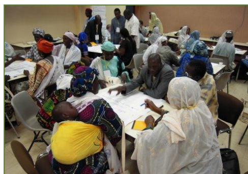
Carousel, Niamey, Niger, 2010