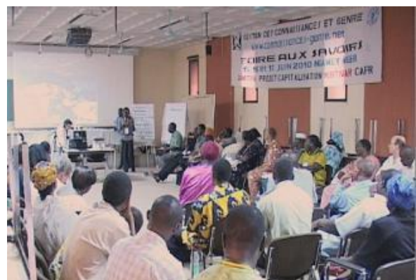
Plenary session, Niamey, Niger, 2010

Events such as a share fair, that include the application of knowledge sharing tools and methods, encourage interaction and thus need careful planning. Even though a fair aims at spontaneous and informal exchange of ideas, improvisation should reside in the flow of thoughts and content, not in the approach.