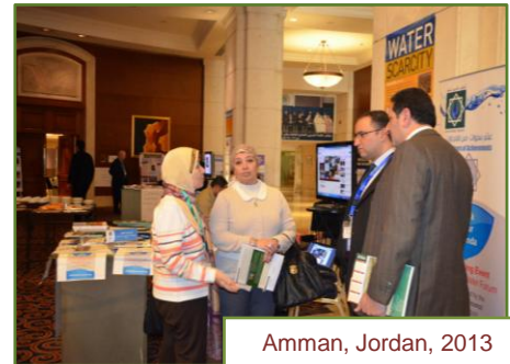
Amman, Jordan, 2013