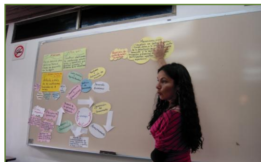
Knowledge sharing in Cali, Columbia, 2010