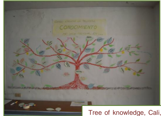
Tree of knowledge, Cali, Columbia, 2010

Be flexible and pragmatic: agendas change, the space you had planned for may not be available, but you will find a solution. You may need to adapt an approach to suit a session or space. For example, at the 2013 Ouagadougou share fair, a "marché aux idées" was planned. This could have taken several forms: an interactive marketplace with stands or tables, or a large World Café, or something else entirely. In the end, time was short and options were limited, so an adapted Round Robin was used, with four thematic corners with the question: During the Fair, what is the key innovation you have discovered to increase resilience? Four groups of participants were split into smaller informal groups, discussing to find a common answer, with seven minutes for each question round.