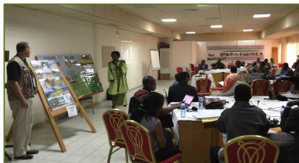
Poster session with simple equipment, Ouagadougou, Burkina Faso, 2013

Specific needs for specific sessions: Make sure you have a complete list of specific material the presenters and the facilitators need for their session, like a laptop, video projector, a microphone, sound system, extra tables, etc. Check the material with the presenters and the facilitators before each session. It is important that they do not have to go and look for something at the last minute. Do a sound check before the session. Make sure that all required training material is made available on a table in the session room. Ideally, it should also be posted on the fair's Web site beforehand. If moveable tables, chairs, tents, power, and additional WiFi are needed, this also requires advance planning.