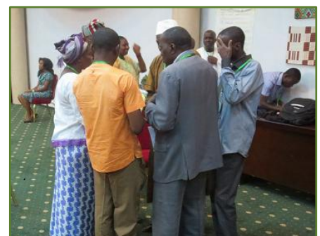
« Marché aux idées », Ouagadougou, Burkina Faso, 2013

Be flexible and pragmatic: agendas change, the space you had planned for may not be available, but you will find a solution. You may need to adapt an approach to suit a session or space. For example, at the 2013 Ouagadougou share fair, a "marché aux idées" was planned. This could have taken several forms: an interactive marketplace with stands or tables, or a large World Café, or something else entirely. In the end, time was short and options were limited, so an adapted Round Robin was used, with four thematic corners with the question: During the Fair, what is the key innovation you have discovered to increase resilience? Four groups of participants were split into smaller informal groups, discussing to find a common answer, with seven minutes for each question round.