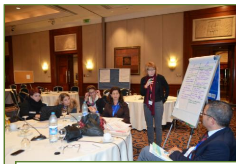
After Action Review with the team, Amman, Jordan, 2013

At the end of each day, there needs to be a session for the core team of organizers, facilitators, resource persons, information and communication teams to meet to debrief, evaluate the day, and do an After Action Review (AAR). The After Action Review is an excellent knowledge sharing method to assess how things went. It allows you to benefit from collective perspectives, experiences and learning of organizing and participating in a particular event. The end of day AAR for a share fair has a monitoring purpose and can be centred on a few questions to collect people's feedback. Examples: "What worked well and why?" and "What should we do differently tomorrow?". The different teams may also wish to meet at the beginning of each day to discuss, harmonize approaches and learn from each other's experiences.