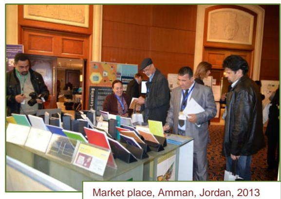
Market place, Amman, Jordan, 2013

A detailed programme is needed at the time of registration, at the very latest. It should not be changed afterwards, except in exceptional circumstances. This process takes more time, but it enables participants to make an informed choice.