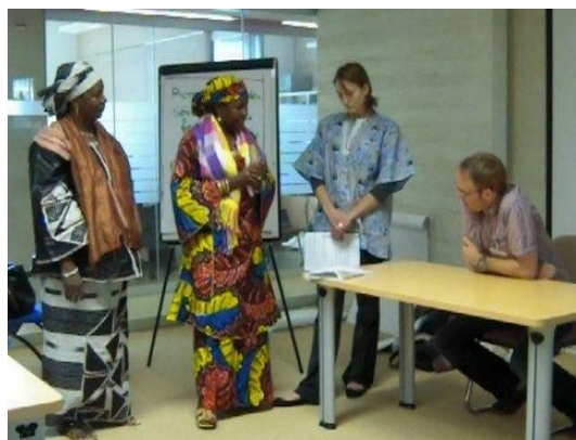
Rome, Italy, 2011