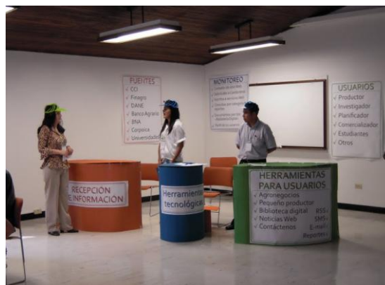
Cali, Columbia, 2010

Plenary sessions: Start by presenting the programme, the organizers, the use of participatory methods, and topics and themes that are covered during the fair. Speeches should be short and limited to 15-20 minutes. Limit plenary sessions to maximum two a day. Consider having one or more inspirational speakers for your plenary session the first day. If having daily plenary sessions, the morning session should sum up what happened in the different sessions the day before. The closing plenary session on the last day will look back at what was achieved, in contemplation.