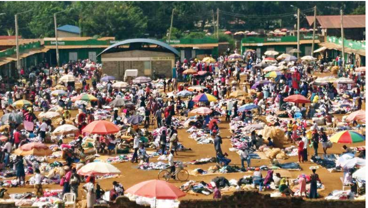
Market in Busia, Kenya at its height.