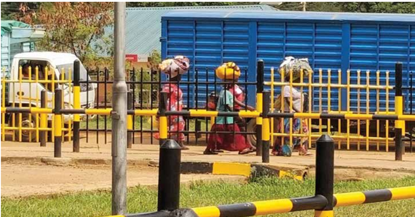
Cross-border traders moving from Busia, Uganda to the Kenya side through the One Stop Border Point.