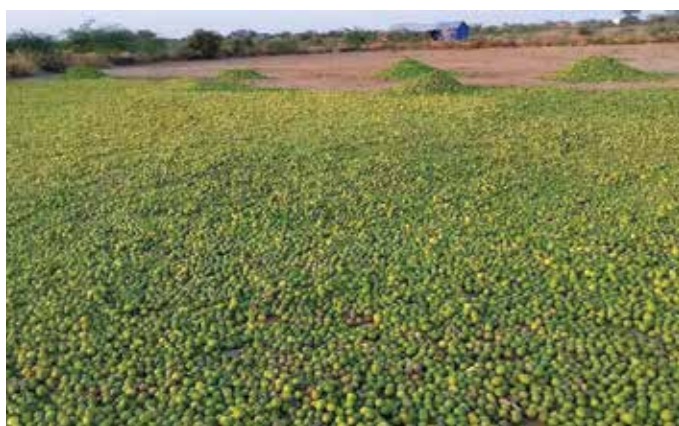
Lemons dry under the sun.

In spite of this, one man saw the potential of farms and maximised on it. It is individuals such as Ibrahim Omar that the Building Opportunities for Resilience in the Horn of Africa (BORESHA) project’s grant facility will be looking for – small farmers with big ambition.