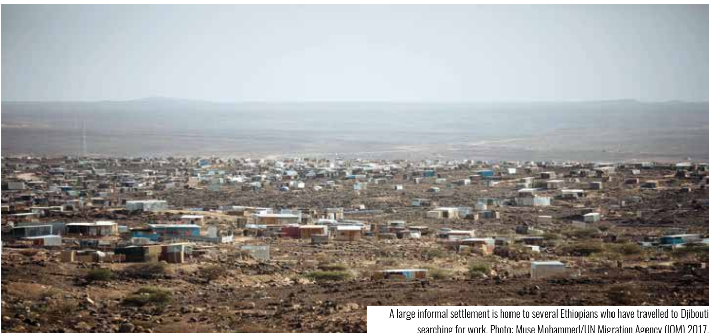
A large informal settlement is home to several Ethiopians who have travelled to Djibouti searching for work.