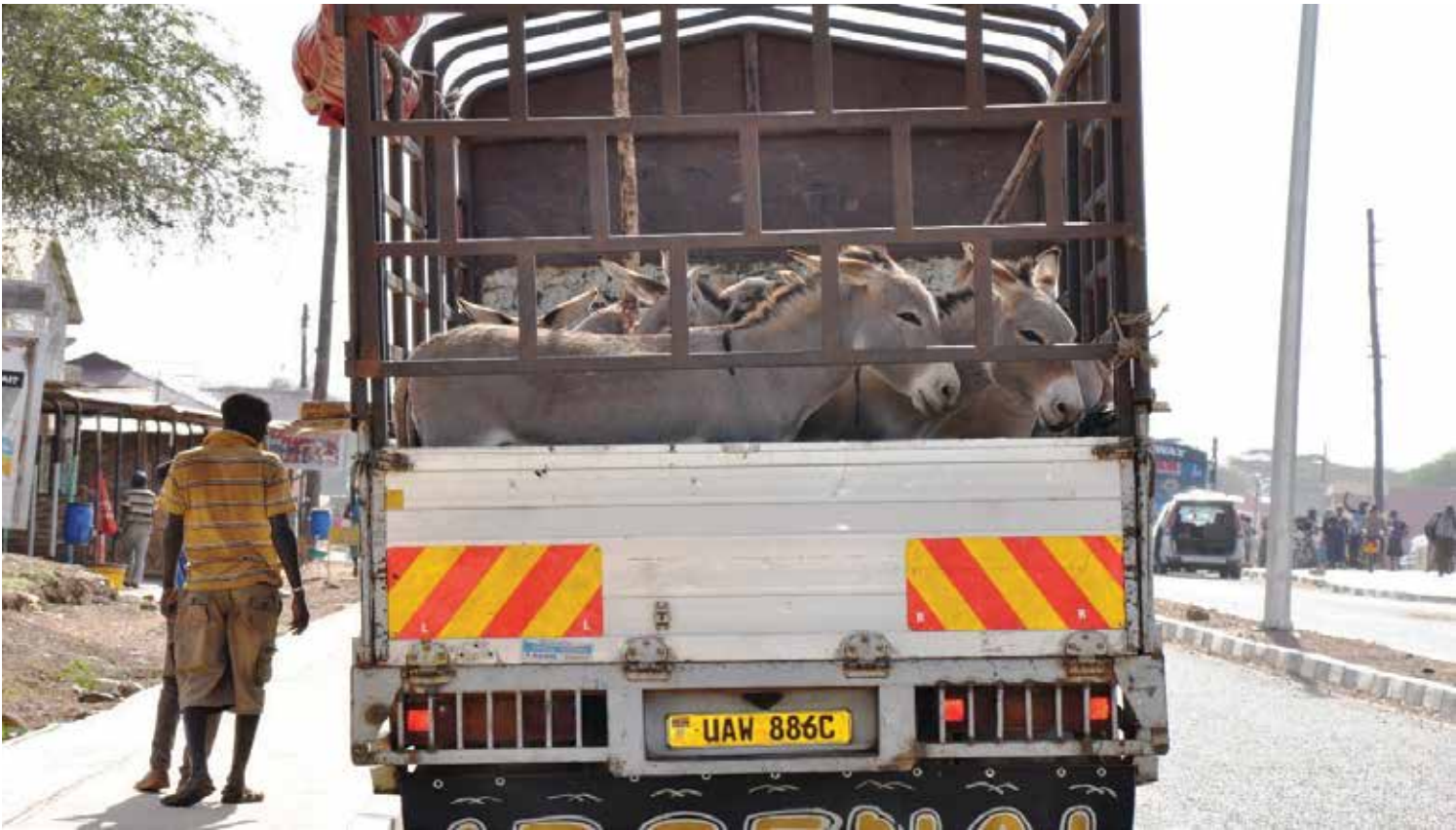
A trader transports donkeys bought from Nadunget livestock market in Moroto in Uganda destined for better market through Moroto town.