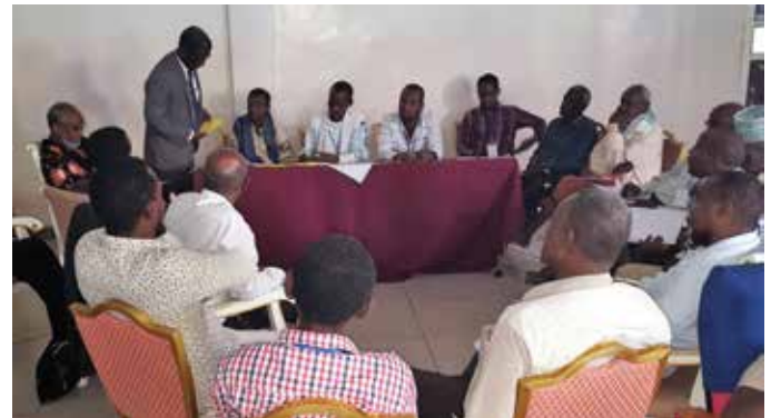
Group work on priority issues for cross-border cooperation in Dikhil Cluster.

Cross-border dialogues organized for the Karamoja and Dikhil Clusters created a common platform to discuss development issues in the clusters, and create joint understanding of contexts in the clusters. They facilitated experience sharing on past areas of cooperation,