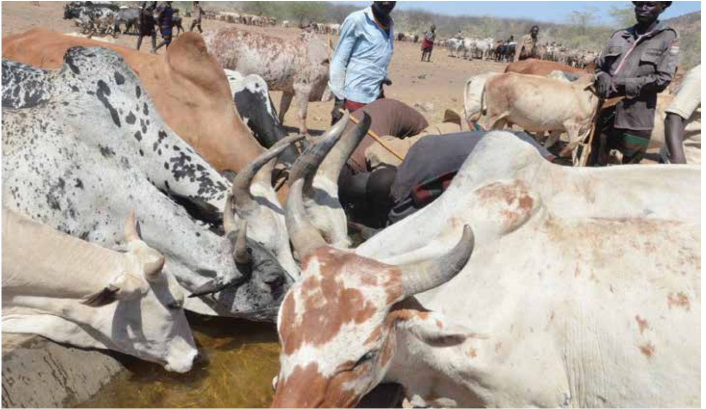
Livestock herds of the Karimojong of Uganda and the Turkana of Kenya converge for watering at Kobebe Dam in Moroto, Karamoja-Uganda.