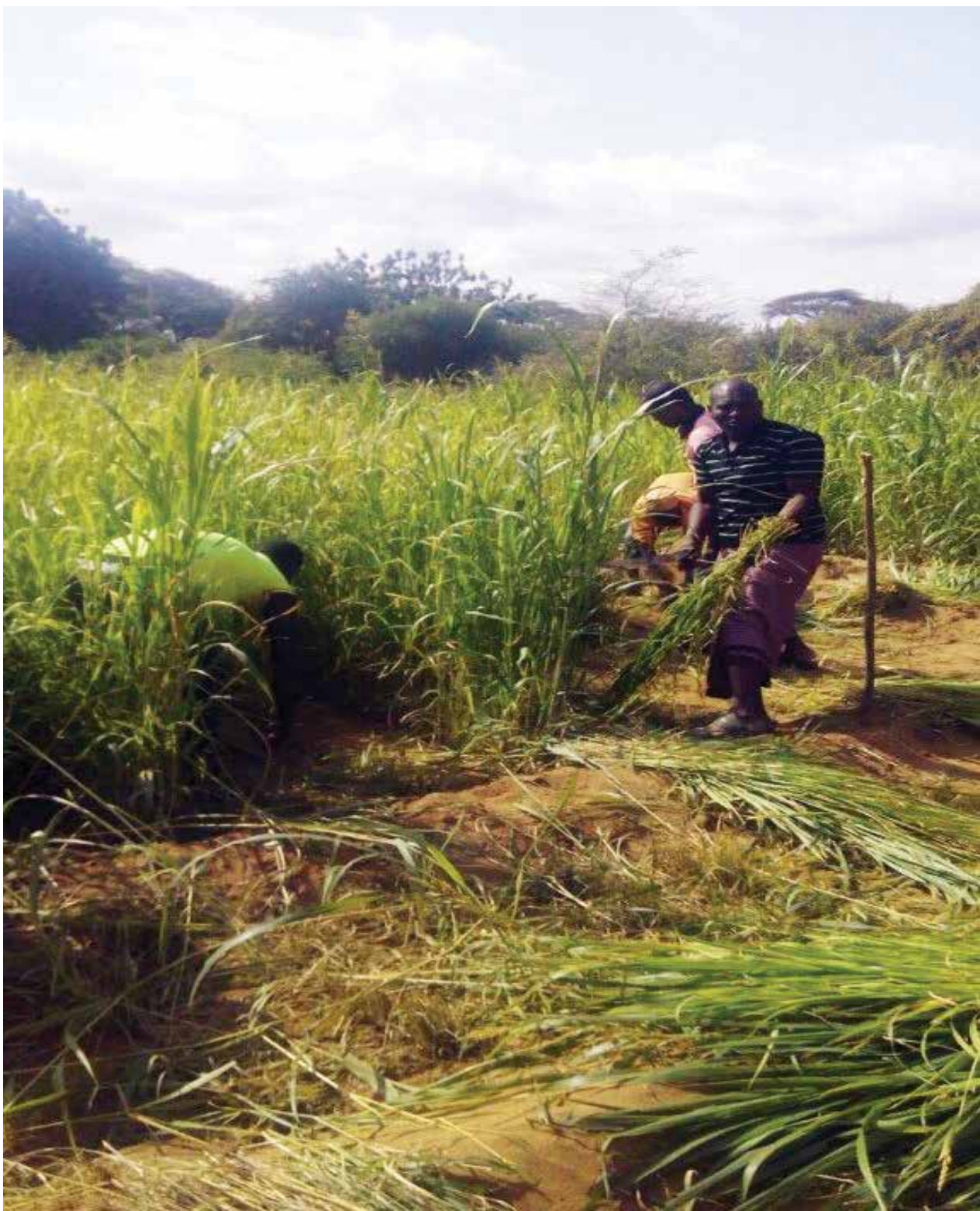
Harvesting of fodder at Girissa Manderu.