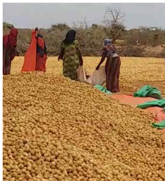
Women selecting and sorting lemons.

As a result of Ibrahim's initiative, more than 100 farmers in the local area have transformed their farms from subsistence farming to economically viable enterprises. Hundreds are now employed in the dried lemon industry value chain; many of these are women. It is women who dry the lemons – spreading them out and turning them over to get even exposure to sunshine - and then do the selection for local and export markets. Dried lemon is the biggest employer and the sole export earner in the region.