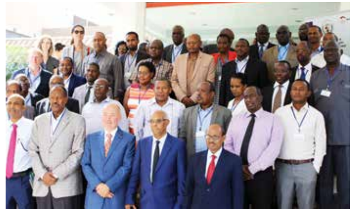
Group photo of participants of the 9th Platform Steering Committee Meeting held in Djibouti on 17-18 December 2018.

The IGAD Secretariat, Member States and selected cross-border projects presented their progress reports. Plenary discussions were held to discuss objectives for the implementation of the second phase of IDDRSI (2018-2022); review of the platform governance structure; strengthening links between IDDRSI and regional and continental frameworks, particularly, the Sustainable Development Goals (SDG) and the African Union Agenda 2063; as well as evidence-based reporting through strengthening of statistics capacity in the region. Participants also had opportunities for side meetings, informal interaction and networking.