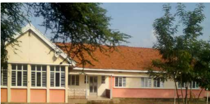
Building housing the offices of the First IGAD Cross-border Development Facilitation Unit recently established in Moroto, Karamoja, Uganda

In view of the widely acknowledged necessity for cross-border cooperation in the implementation of IDDRSI; and within the framework of the recommendations and collective decision made by IGAD Member States and development partners, IGAD, with the support of BMZ/GIZ, established a Cross-border Development Facilitation Unit in Moroto to facilitate cooperation in the implementation of IDDRSI, among the 4 countries (Kenya, Uganda, Ethiopia and South Sudan) that share boundaries in the Karamoja Region. The Cross-border Development Facilitation Unit (CBDFU) established in Moroto, Uganda in February 2017, becoming the first of several other such units that, in due course, will be established in other cross-border areas (locations to be decided by IGAD in consultation with the affected countries and development partners), with each unit having the functions listed below.