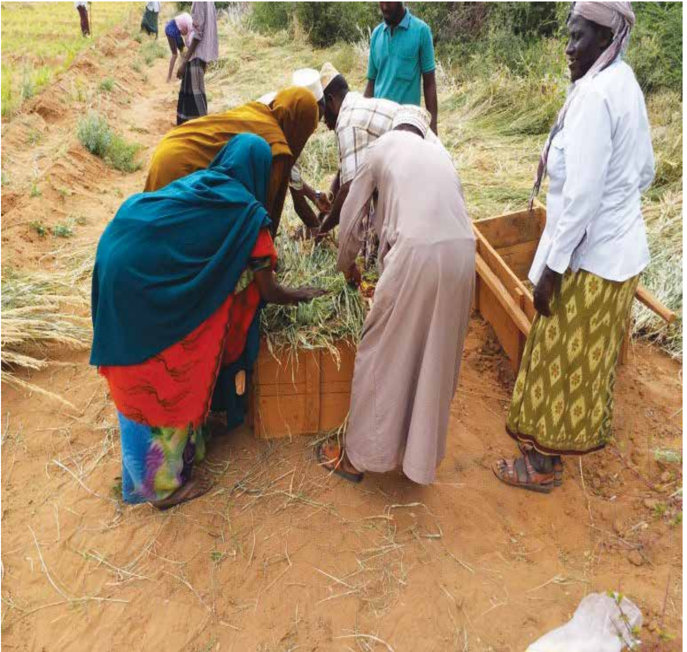
Men women and youth participate in the whole learning process from sowing to storage.

We have successfully replicated fodder production in our farms, improving our output and enhancing our living standards.