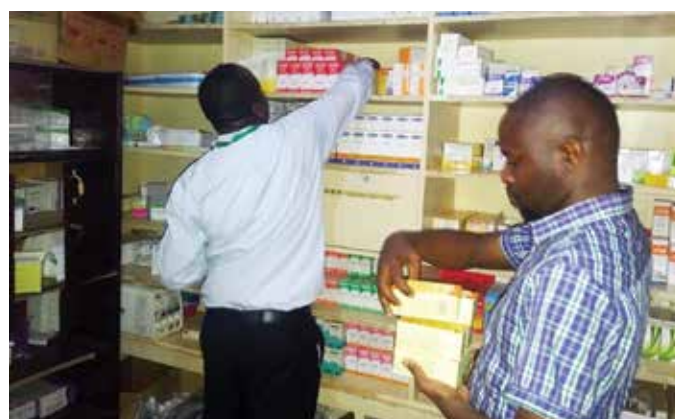
Medicines samples for quality analysis in process in one of the health facilities in Uganda-Kenya border.

Strengthening of cross-border post market surveillance of medicines in the region: In December 2018, the IGAD secretariat in collaboration with USAID and IGAD Member States medicines regulatory authorities conducted an assessment to establish the quality of medicines in the IGAD cross-border areas. This involved sampling of Oxytocin, a first line prophylactic and