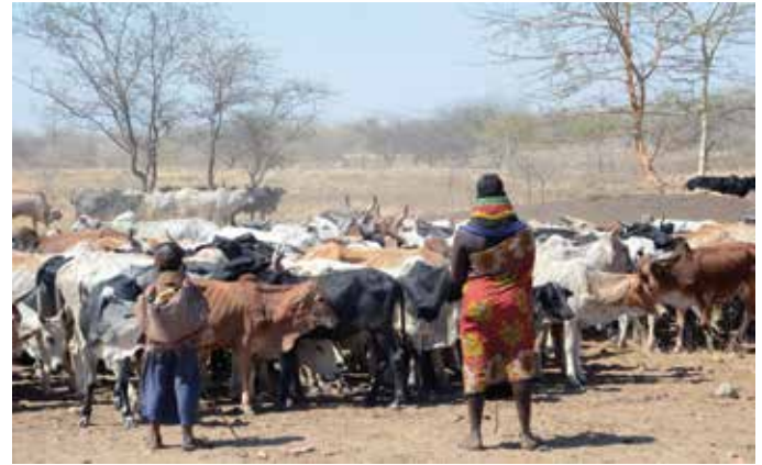
A young girl herding cattle alongside her mother in Loima Sub-county, Turkana County, Kenya.

The peace meetings were supported by the Karamoja Cluster project and organizations that have been working to unite the pastoralist communities of Kenya and