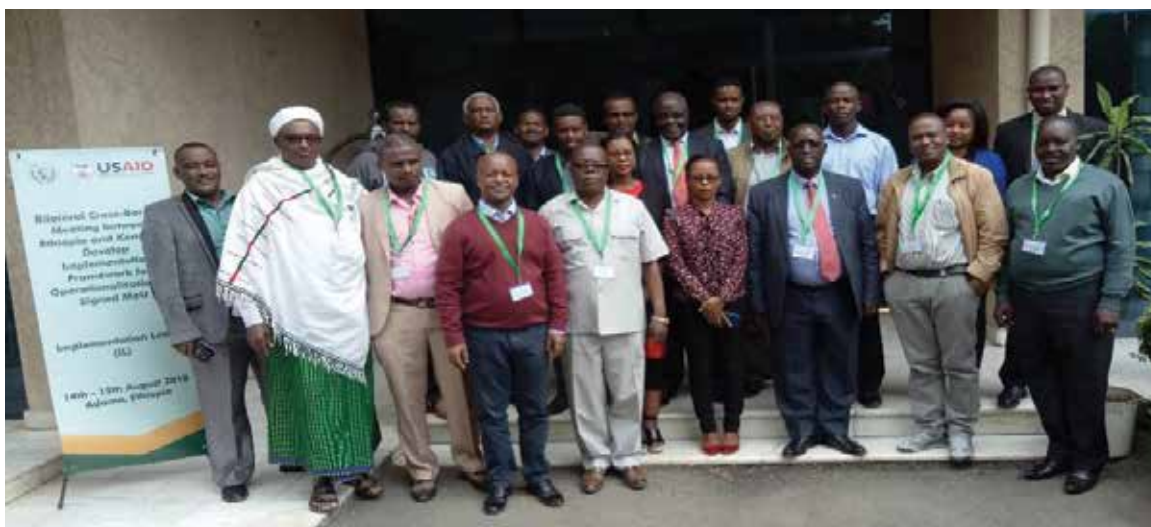
Participants of Ethiopian and Kenya; developed the IF to operationalize the signed MOU.

Bilateral cross border MOUs signed and implementation framework developed: With facilitation of ICPALD, two bilateral MOUs (Ethiopia and Kenya; and Djibouti and Ethiopia) were signed by the ministers of Agriculture in 2016 and 2018 respectively. Considering the major bottlenecks across the borders, the countries agreed on the following areas of collaboration in the MOU: Control of trans-boundary animal diseases (TADs) through surveillance, vaccination, reporting, information sharing, livestock movement control, awareness creation for communities; mapping of stock routes and natural resources (water and pasture), including control of invasive weeds; enforcement of regulations on veterinary drug use; facilitation of livestock trade through quality control and certification; access to Livestock related infrastructure including diagnostic laboratories, cold