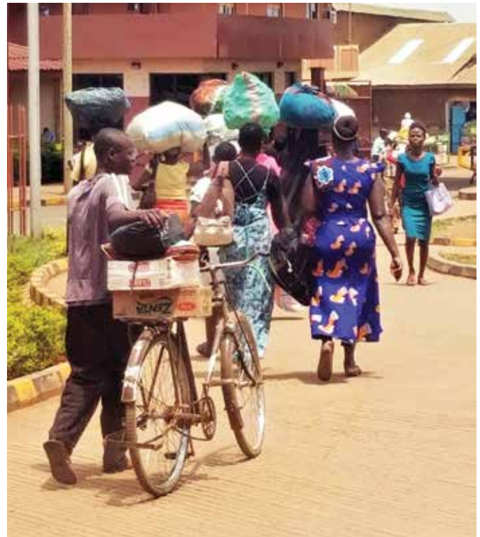
Cross-border traders moving from Busia, Uganda to the Kenya side through the One Stop Border Post.