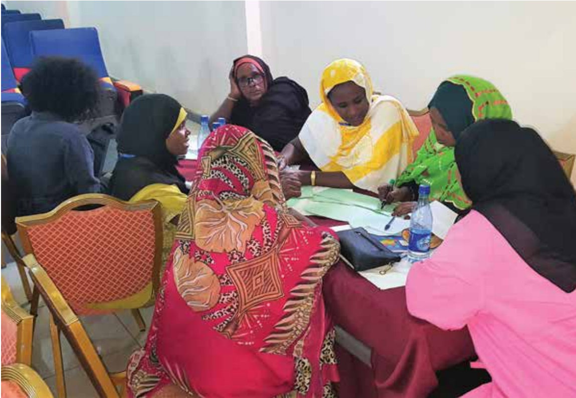
Women's group – Dikhil Cluster.

The Intergovernmental Authority on Development (IGAD) has adopted a 'cluster approach' to strengthen cross-border cooperation among its Member States, which it is implementing in collaboration with its development partners. In order to address the needs of the people in the cross-border areas, a cross-border dialogue was initiated in the Karamoja and Dikhil Clusters. 1