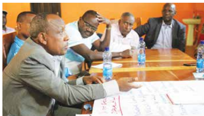
Participants hold discussions to identify ways of strengthening collaboration in cross-border areas.

The share fair responded to the IDDRSI Platform Steering Committee recommendations of May 2018 related to knowledge exchange: (i) conduct regional learning events on best practices for effective coordination of IDDRSI; (ii) promote knowledge management for informed decision making and investment; and (iii) liaise with other partners to organise drought resilience learning events to review and share knowledge on lessons learnt and good practices in resilience programming.