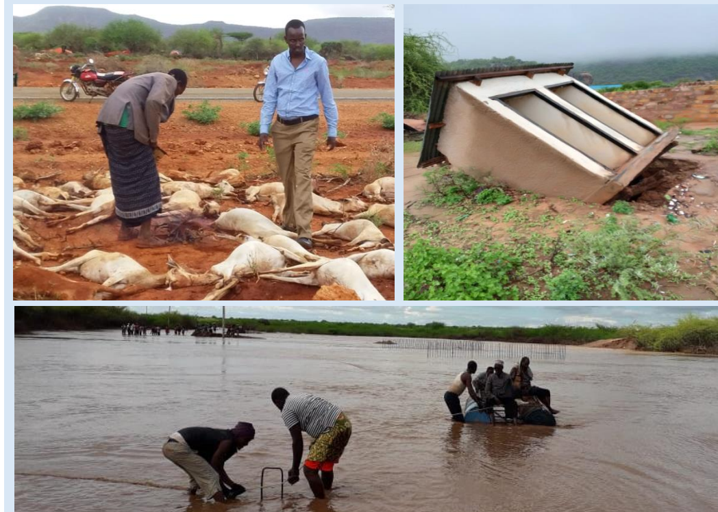
Top left picture: Dead sheep and goats, Mandara County, October 2019

In Mandera South Sub-county, an estimated 8,600 people had been affected, including an estimated 6,300 in El Wak town according to Nation in April 2018.