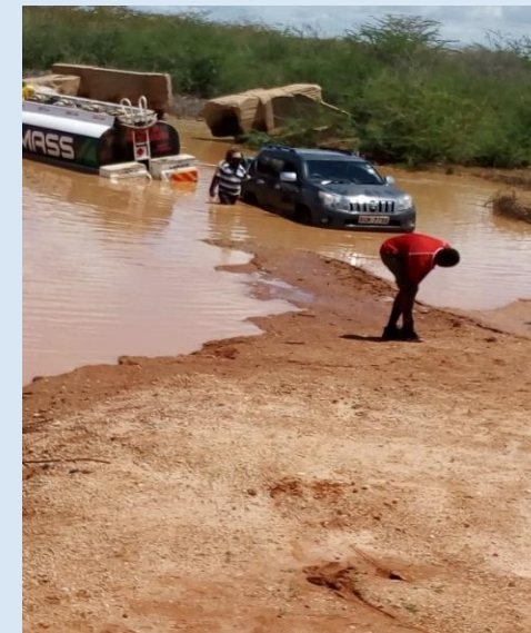
Left picture : Bura Bilbil Road has been cut off by the rains

According to Oxfam rapid assessments 3,093 households have been directly impacted by the flooding either by displacement, loss of livelihoods or loss of shelter.