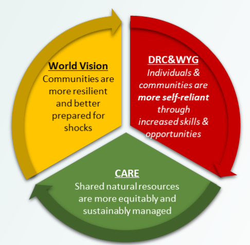
BORESHA partners and their focal result areas