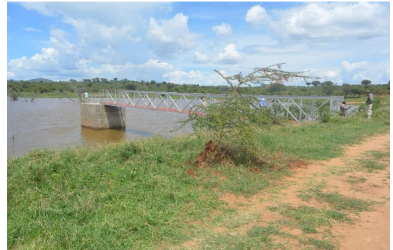
Fig. 1: Valley dam in Napak District