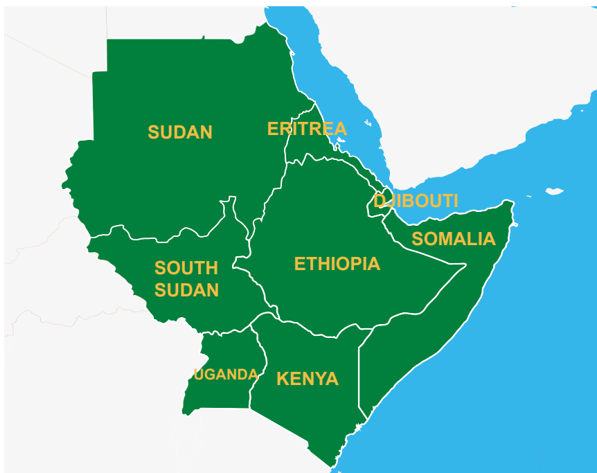
MAP OF IGAD

The Intergovernmental Authority on Development (IGAD) is one of the regional economic communities (RECs) of the African Union. It stretches over an area of 5.2 million square kilometres that comprises Djibouti, Eritrea, Ethiopia, Kenya, Somalia, South Sudan, Sudan and Uganda. The region has 6,960 kilometres of coastline with the Indian Ocean, Gulf of Aden, Gulf of Tadjoura and the Red Sea.