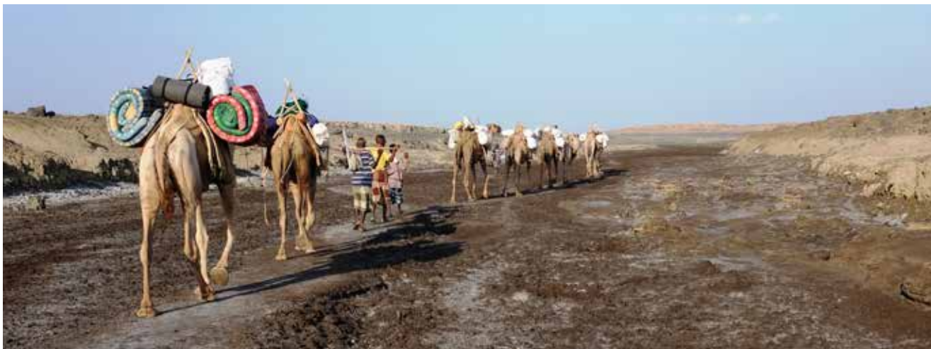
People at Lake Abbe

Under the agriculture, livestock and food security programme area, IGAD is implementing the following programmes and projects: