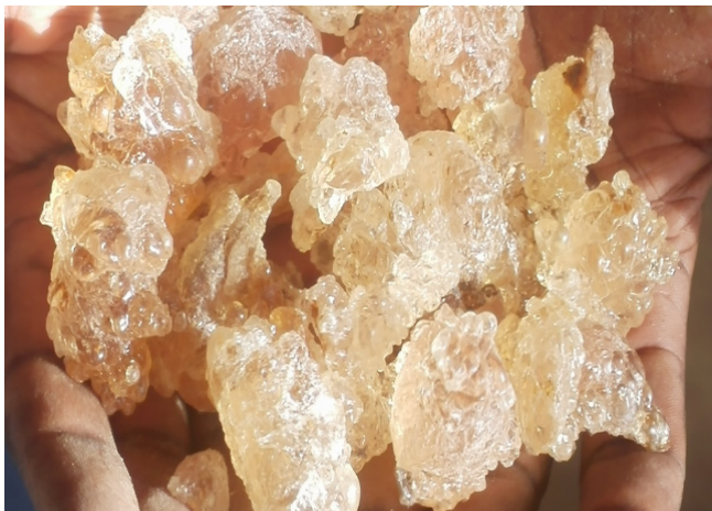
Gum Arabic from Northern Kenya

In addition to livestock production, rangelands in the region are habitats for a diversity of flora and fauna of socio-cultural, environmental and economic significance. These are a source of various goods such as timber and non-timber products e.g. fibre, gum and resins, honey, medicinal and food plants. In addition, the rangelands provide various ecosystem services that include water catchment, scenic beauty, as well as habitat for wildlife that form the basis of ecotourism in respective countries. Rangelands also host sacred sites that are valued for spiritual and religious purposes.