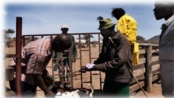
Livestock marketing in Baringo County