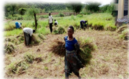
Kamar Pasture Production in Baringo County