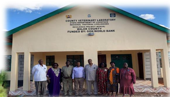
Veterinary laboratory in Wajir County