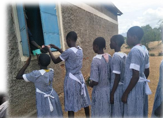
School feeding program. Kainuk girls, day and boarding primary school