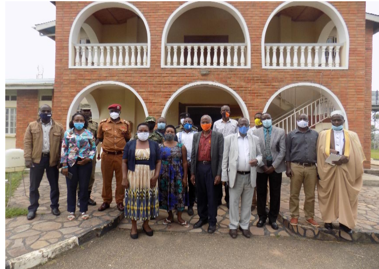
Peace committee training in Ntungamo