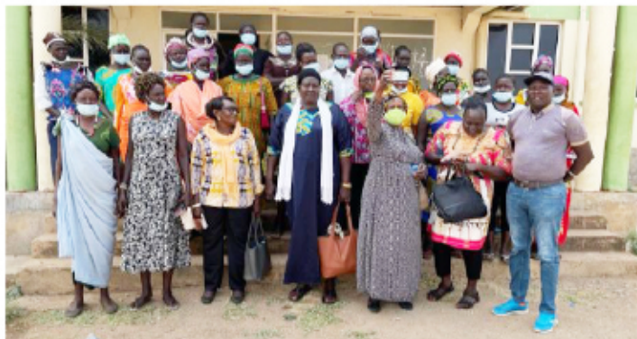
Mogila women association at Kapoeta East County headquarters posse for a photo after 5 days on entrepreneurship.