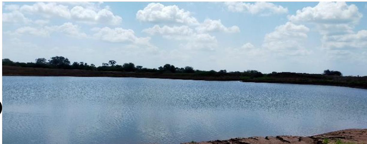
< Qalanqalesa earth pan (50,000 M 3 ) in Mandera County